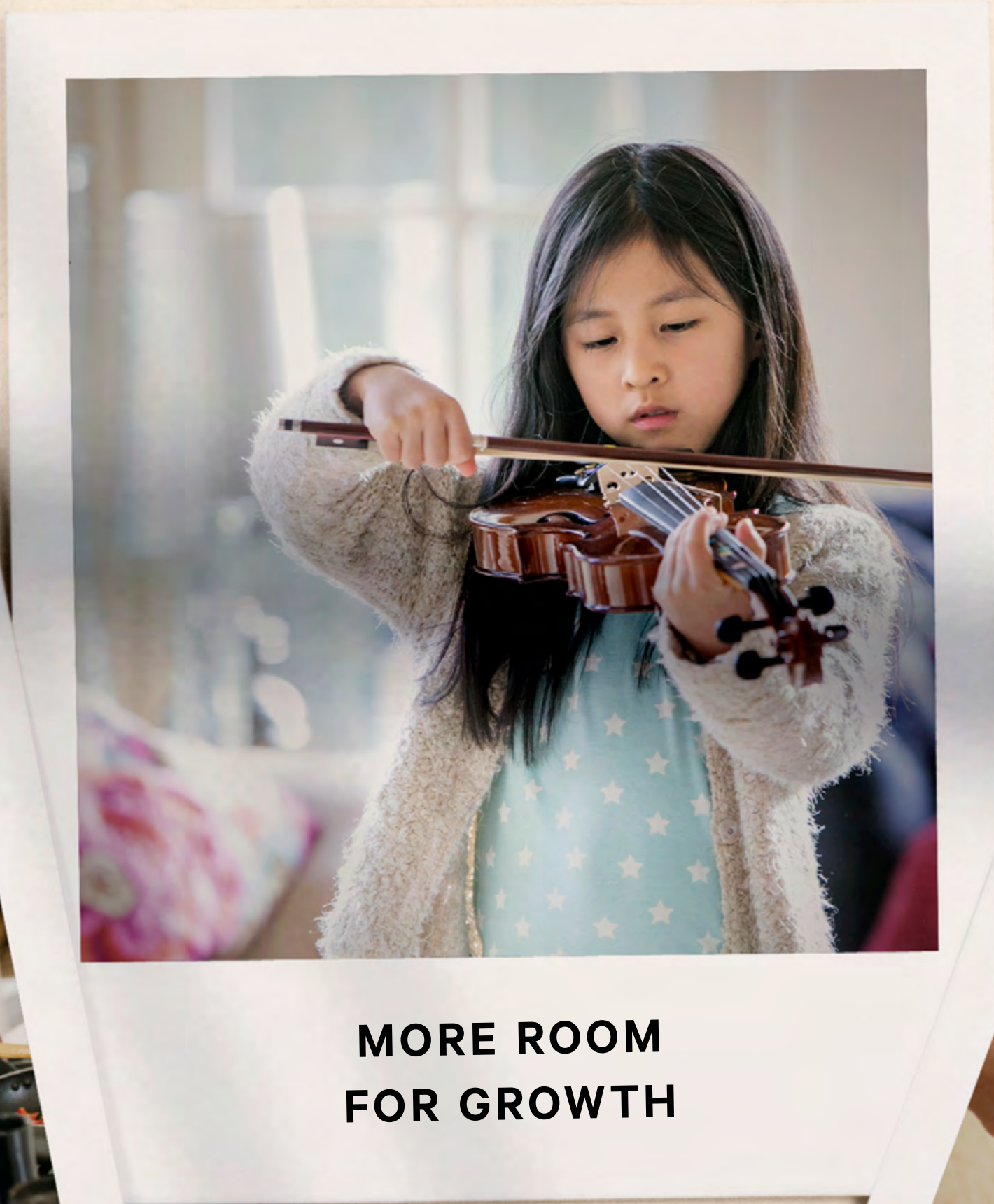
MORE ROOM FOR GROWTH