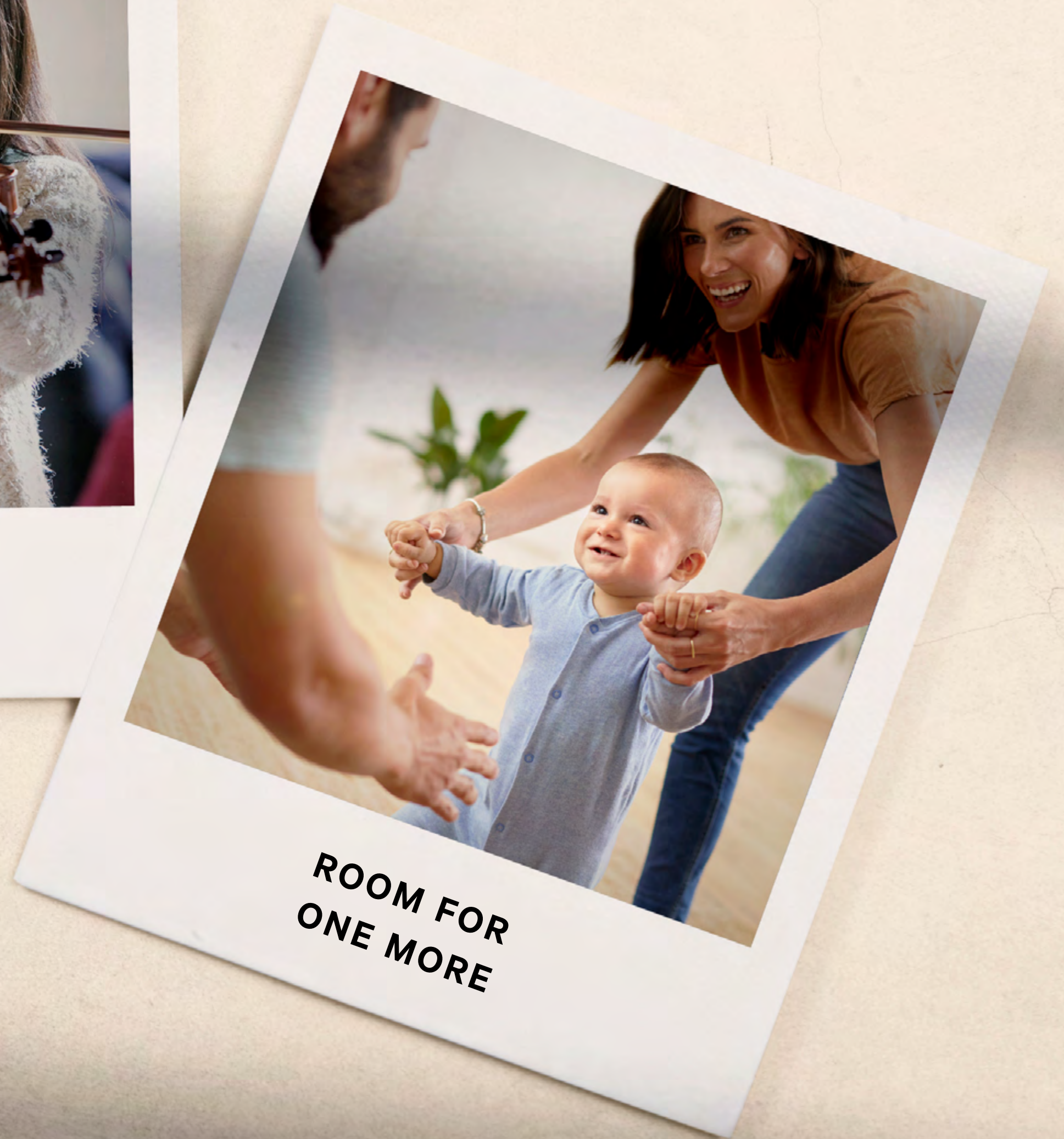
ROOM FOR ONE MORE